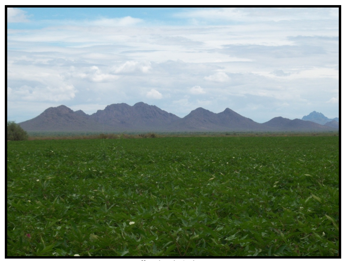
Offered Exclusively By:

Seller financing to qualified buyer available.